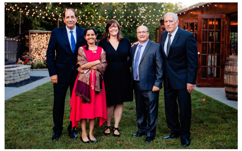
Five of our six 2020 September Celebration of Champions awardees

Our annual September Celebration of Champions honors allies in the anti-sexual violence movement for their efforts to advance our mission and create a safer Garden State.